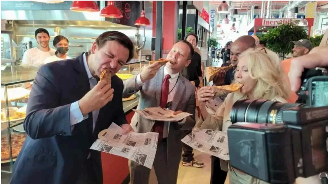
Gov. Ron DeSantis bites into a slice of pizza at the opening of Delray Beach Market in 2021 before it shuttered in Jan. 30, 2023.